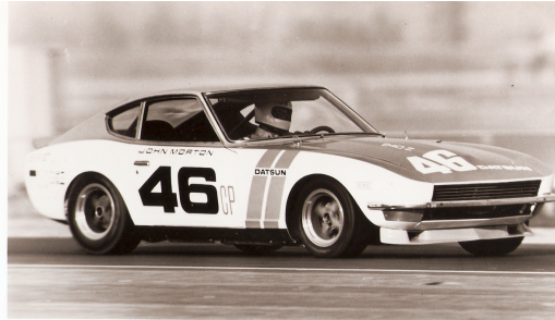
#46 NISSAN 240Z